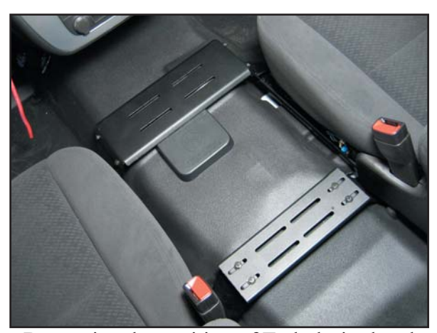
Determine the position of Trak desired and mark location with a pencil on the hump brackets.. Remove the front and rear hump bracket cross support.